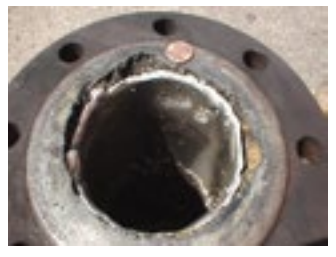
Severe Flange Corrosion